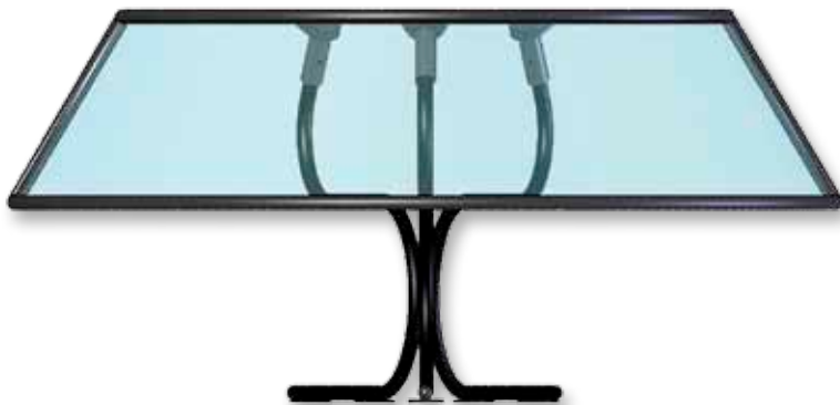
Front view of Carousel