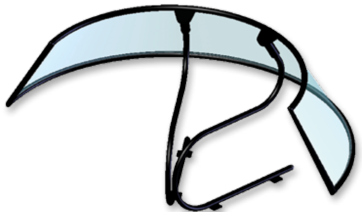
Stand alone half-round Carousel with standard Carousel stands